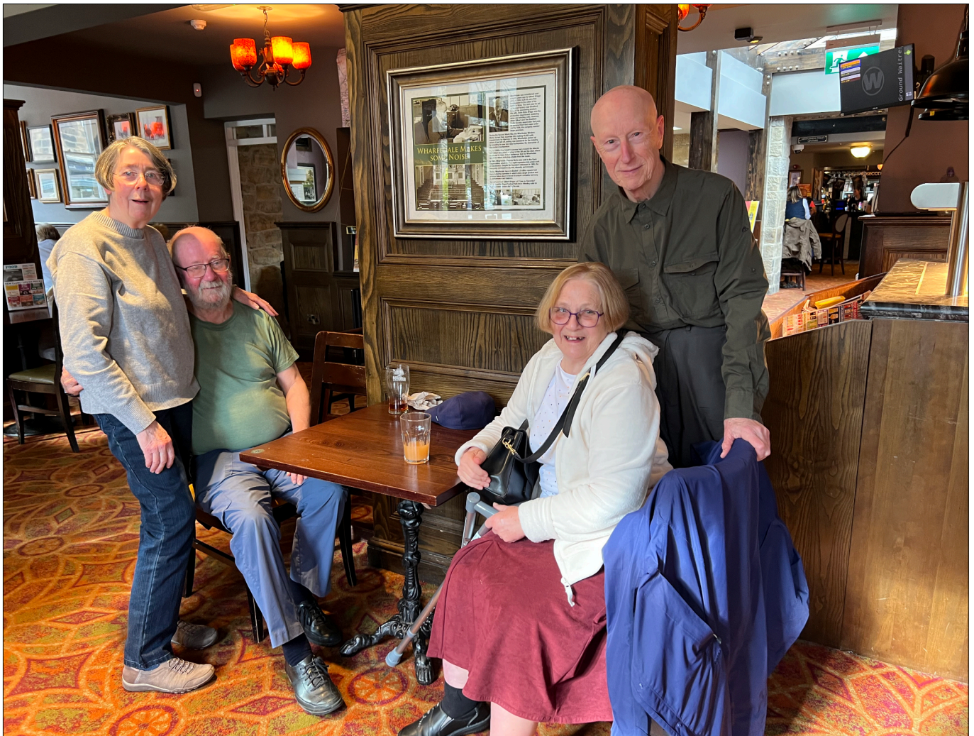
A Serendipitous Meeting in Otley